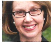
Ellen Rosenblum, OR