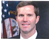
Andy Beshear, KY