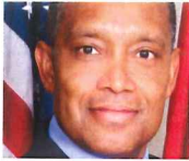
Karl Racine, DC