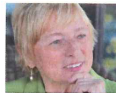
Janet Mills, ME