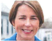
Maura Healey, MA