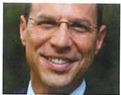
Josh Shapiro, PA