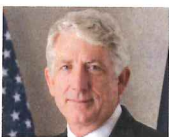
Mark Herring, VA